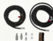
Front-End Loader Hose Kit PN 196056