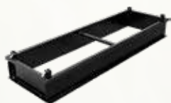
Hopper Extension PN 230459