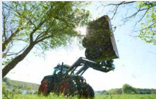
Rotary Hedge Cutter RC 132