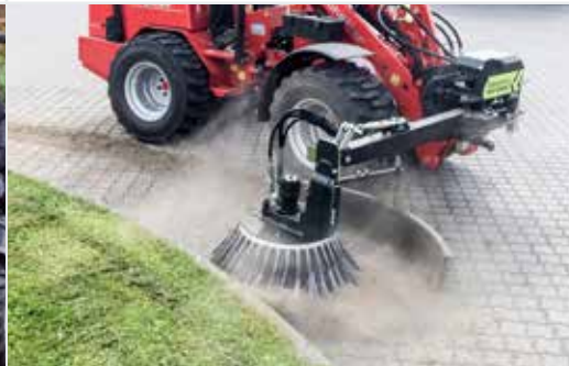
Weed Clearing Brush BR 70