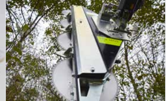
Quadsaw LRS 1602