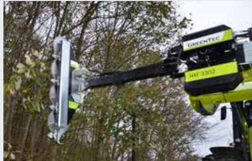
Quadsaw LRS 1602