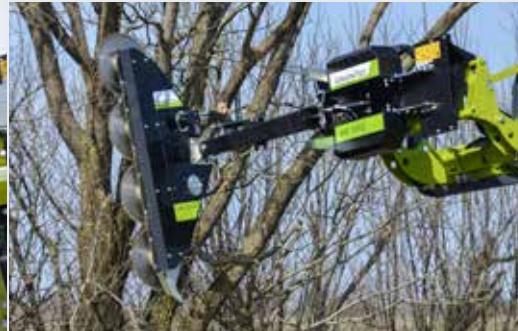
Quadsaw LRS 2002