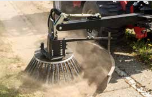
Weed Clearing Brush BR 70