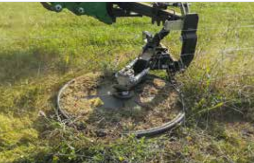
Barrier Mower RI 60 & 80