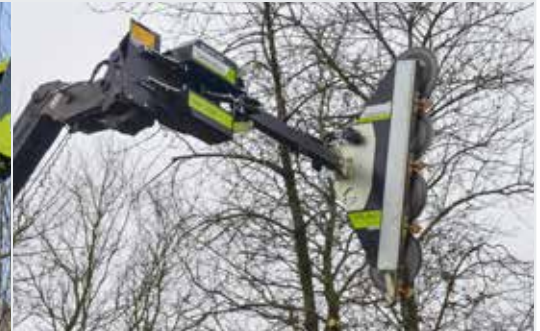
Quadsaw LRS 2402