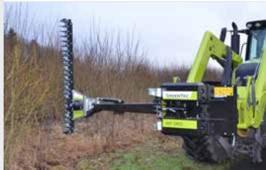
Cutterbar HL 182 & 212