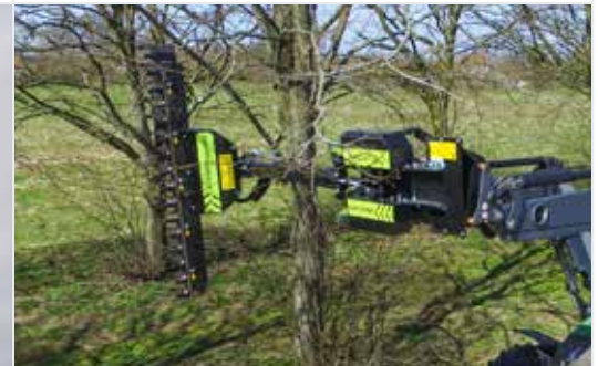
Cutterbar HX 170 - 270