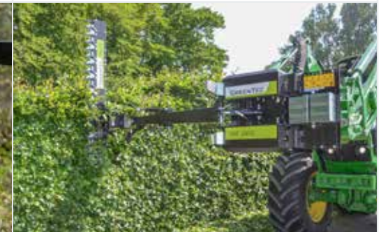
Cutterbar HS 172