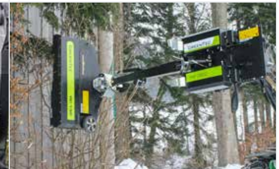
Rotary Hedge Cutter RC 132