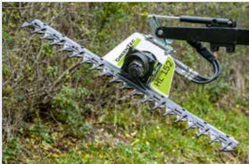
Cutterbar HL 152 - 212