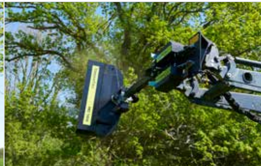
Rotary Hedge Cutter RC 162