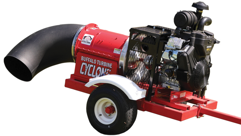
MEGA Debris Blower

WARNING: Cancer & Reproductive Harm - www.P65Warnings.ca.gov