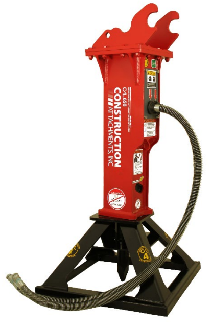
Breaker shown with Kubota QC mount *stand sold separately*