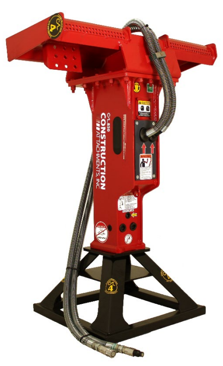
Breaker shown with Skid Steer universal mount *stand sold separately*