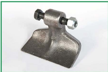
Flat hammer (standard)