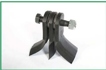
Y shaped blades with straight blade (optional)