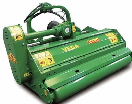
Roller is separated from side-skids

Suitable for grass, greens, set-aside (1 ½" Diameter)