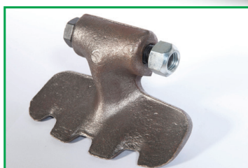
Toothed hammers (standard)