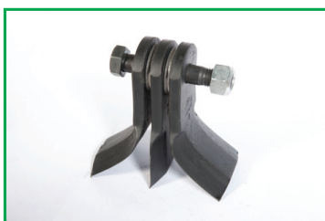
Y shaped blades with straight blade (optional)