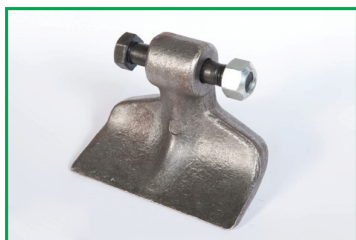
Flat hammer (standard)