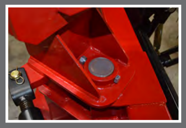
LARGE 2-1/2" MAIN PIVOT PIN