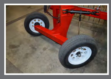
OFFSET 205/75D15 TIRES