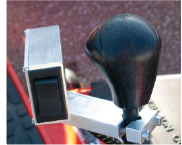
Rocker switch allows the operator to control grapple movement with the touch of a finger.