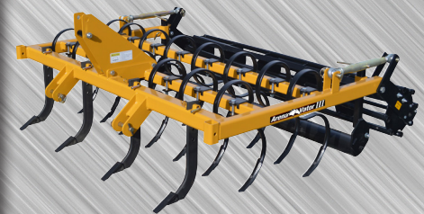
AV3 with optional Scarifier Shanks