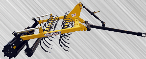
AV3 with optional Pull-Type Hitch, AV3-4 & AV3-5

Optional Equipment: Scarifier Shank Kit, Gauge Wheels, Pull-Type Hitch