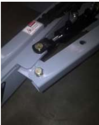
Safety Brace for Transport

Lever 10- Rear Driver Side Blade- (Lower and raise Blade)