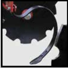
BALK BREAKER OPTION