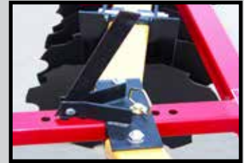
EASY-LEVER GANG ADJUSTER