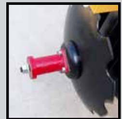
FURROW FILLER OPTION