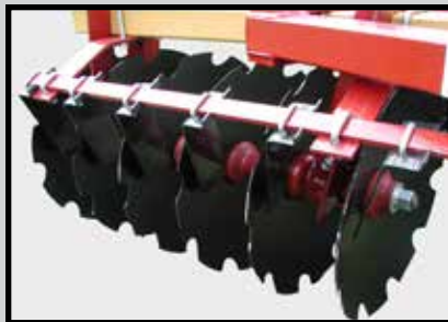
BLADE SCRAPER OPTION